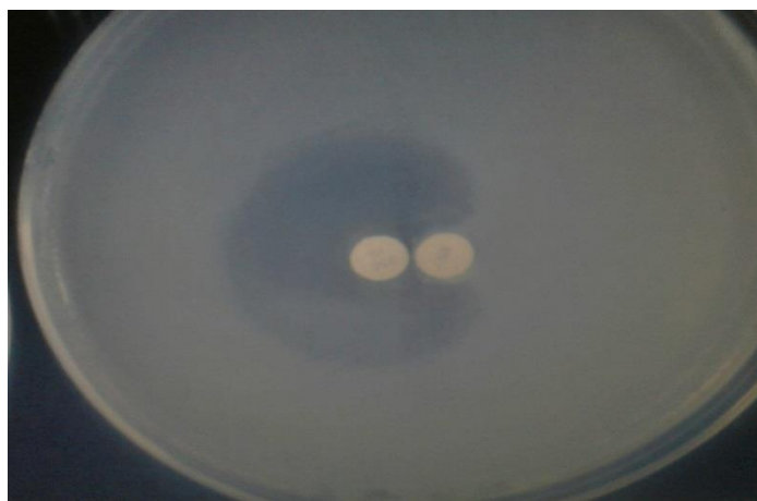
Figure 1. AmpC Disc Test. The notches on the side of the disc represent AmpC \beta -lactamase producing Klebsiella , which prevents the creation of a complete halation around the cefoxitin disk by E. coli ATCC 25922.

Results of the phenotypic tests, which were used to detect MBL enzymes, are presented in Table 2.